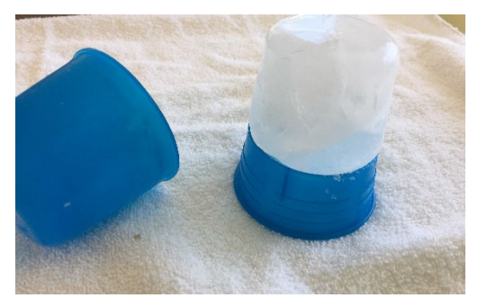
Application of superficial hot/cold modalities

Right Hand Therapy is an AOTA Approved Provider of professional development - Provider #11677. AOTA does not endorse specific course content, products, or clinical procedures.