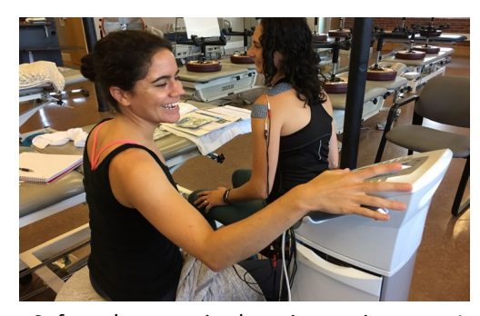
Safe and supportive learning environment!